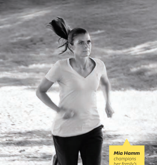
Mia Hamm champions her family's health p. 14